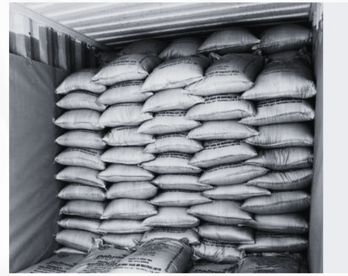
Eco-friendly packaging, dispatch & delivery