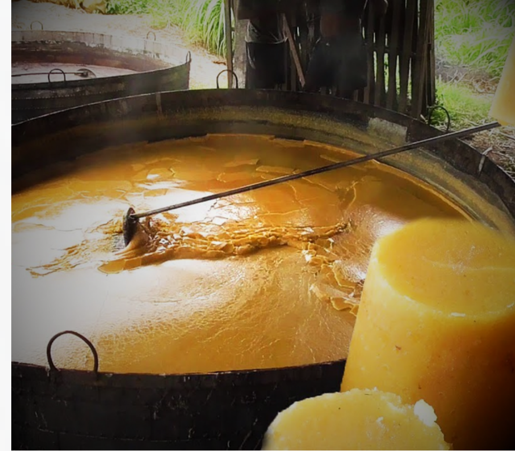
Boiling the raw juice