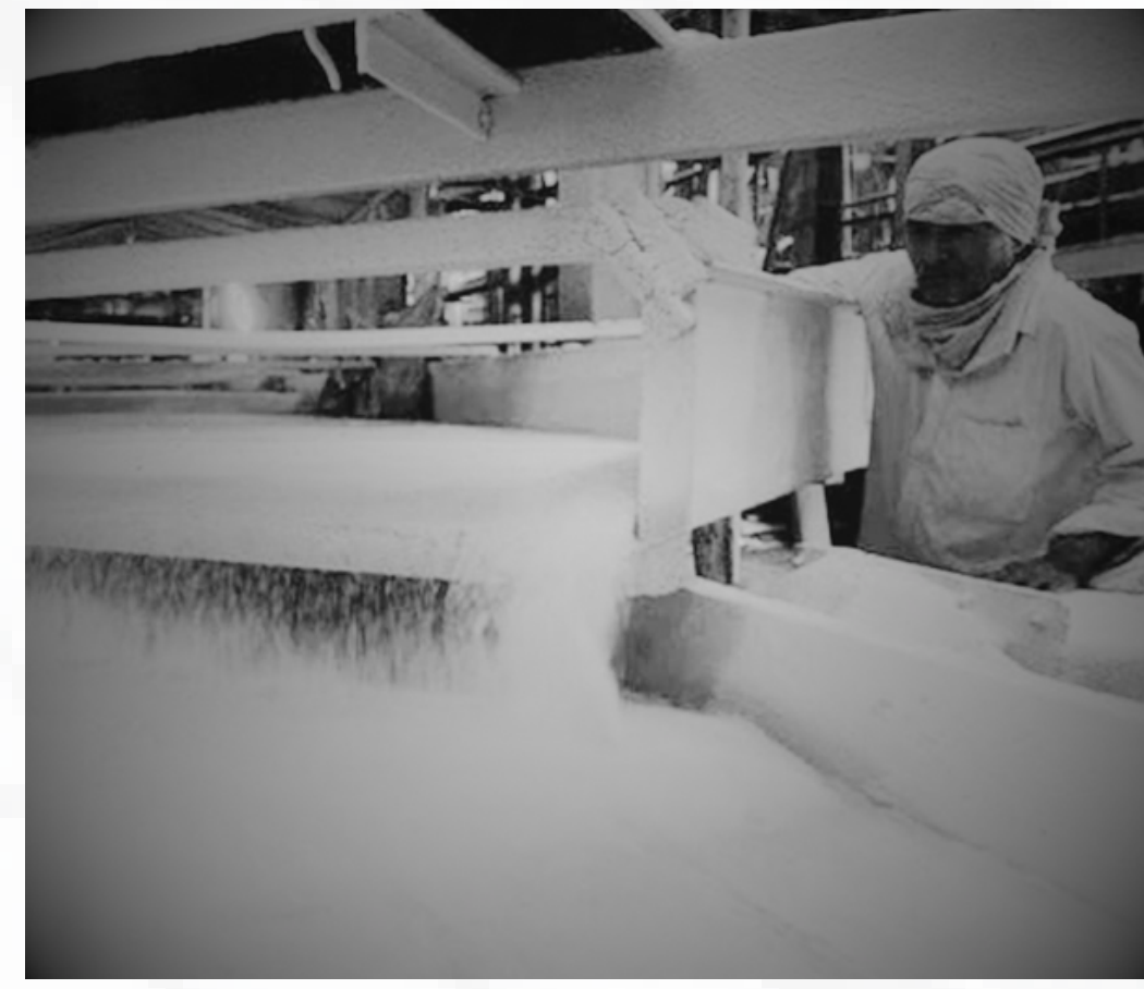
Working on the Crystallization Process of turning syrup to crystals