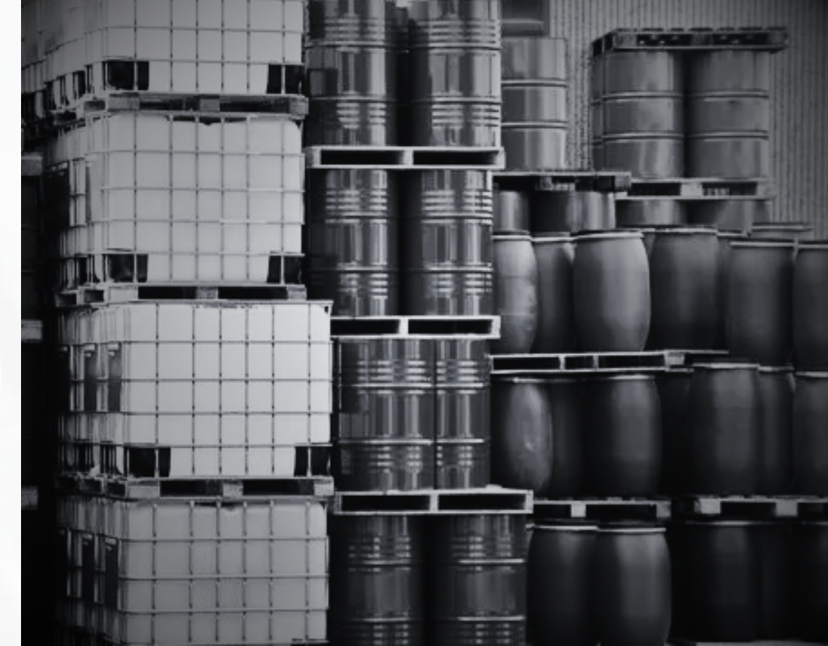
Relocating raw sugar for the refining process