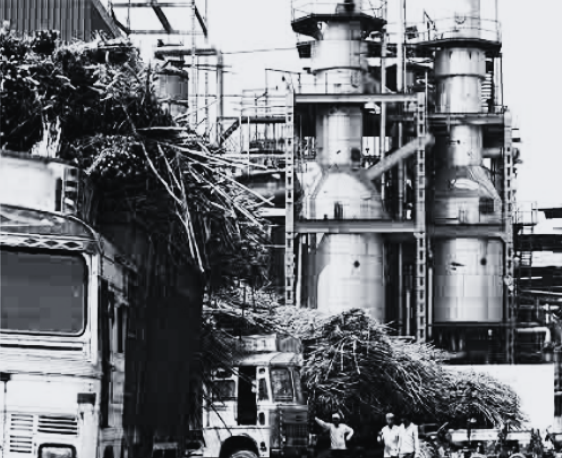
Crushing milling, soaking and squeezing the cane for it's juice