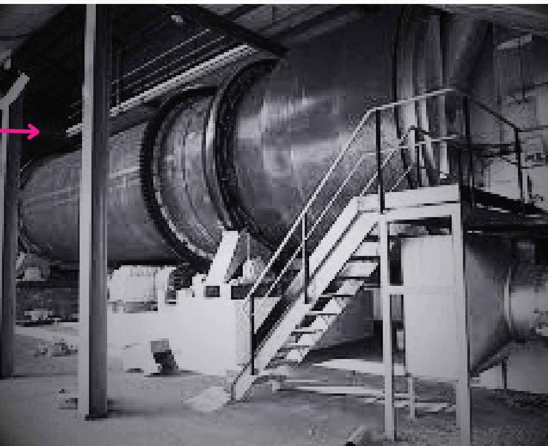
Melting & filtering the impurities to produce sugar syrup