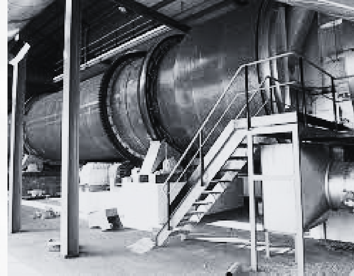
Spinning the crystals in a centrifuge to remove liquid