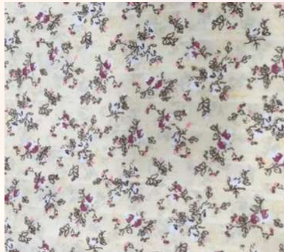
BSY PATTERN DOBBY