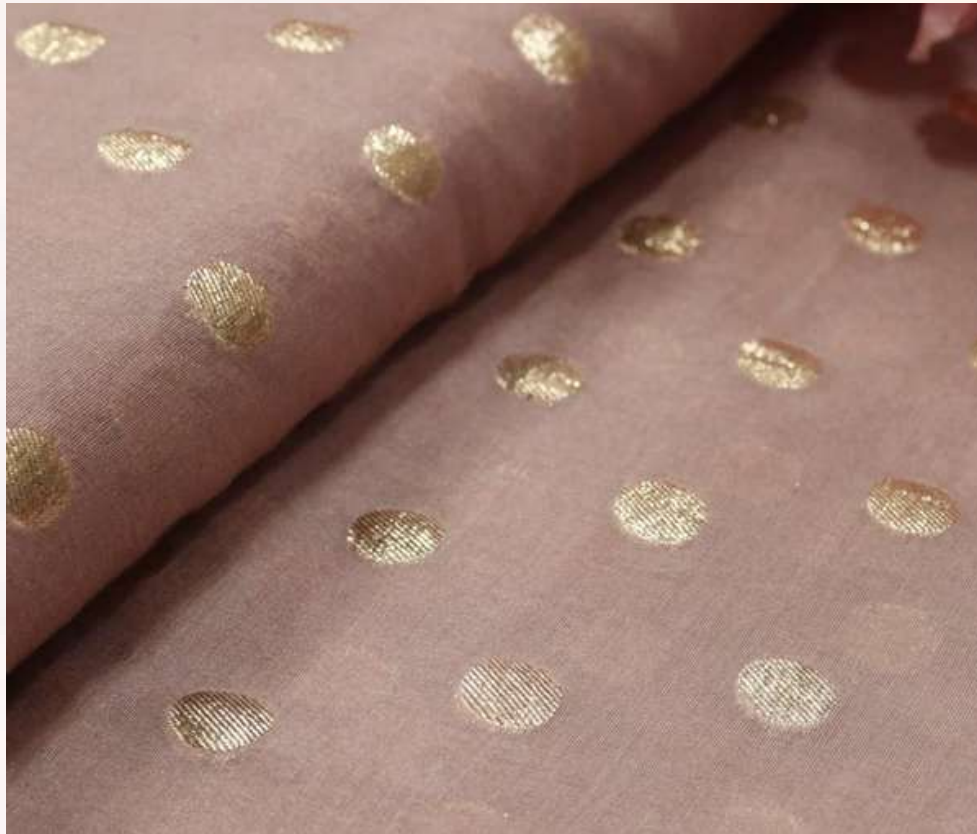
WEIGHT LESS CHANDERI SILK