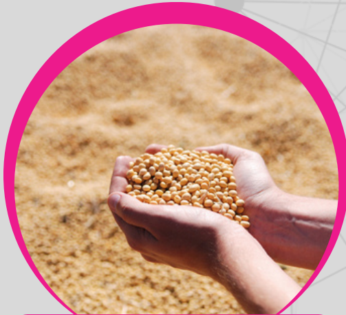
Indian Agro Goods